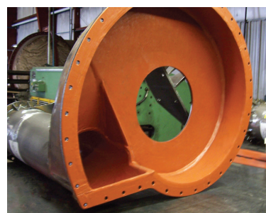
36" Dia. Pump Housing