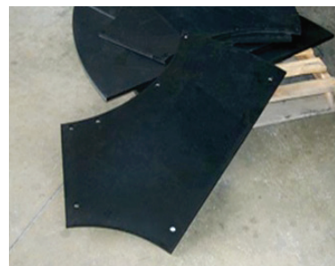
Bolt-In Liner For Mixer