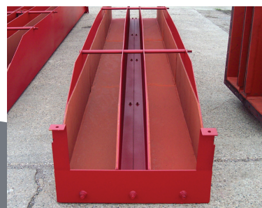
3' x 20' Sand Flume