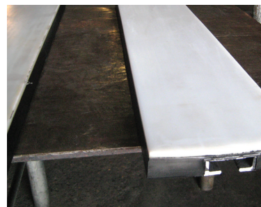
9-1/4" W x 48" L Custom Impact Bar