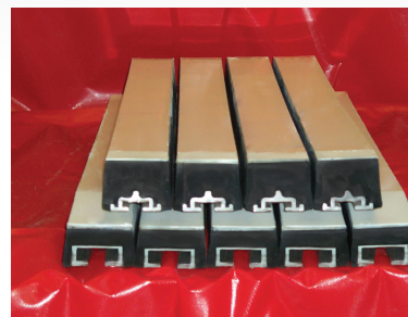
Impact Bars w/ Aluminum and Steel Inserts